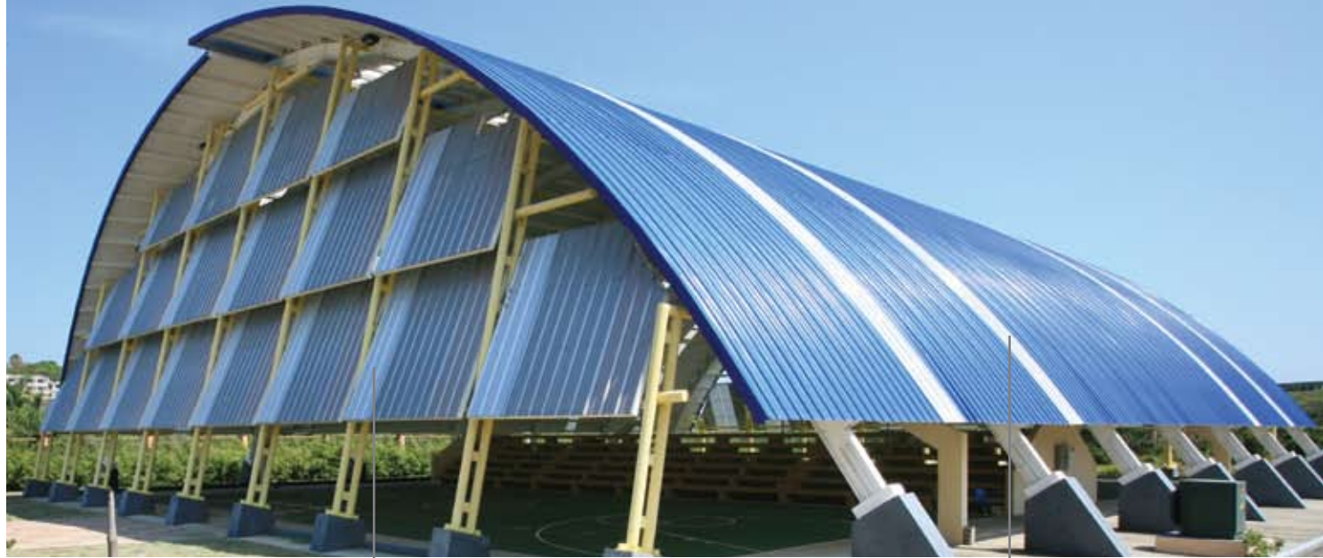
PLANCHA TRANSLÚCIDA SKYLIGHT PANELS